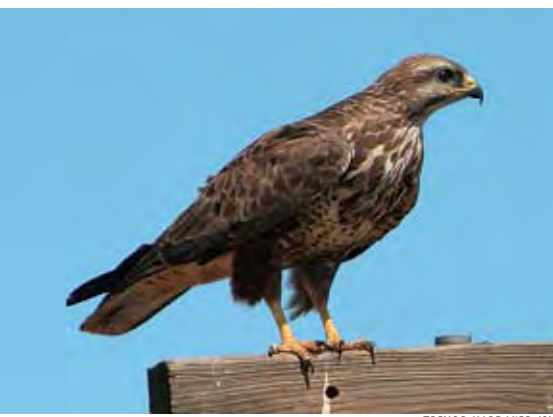
TREVOR HARDAKER (2)