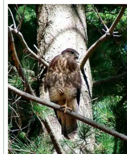
Left The fledged juvenile buzzard seen in Tokai, 2002.