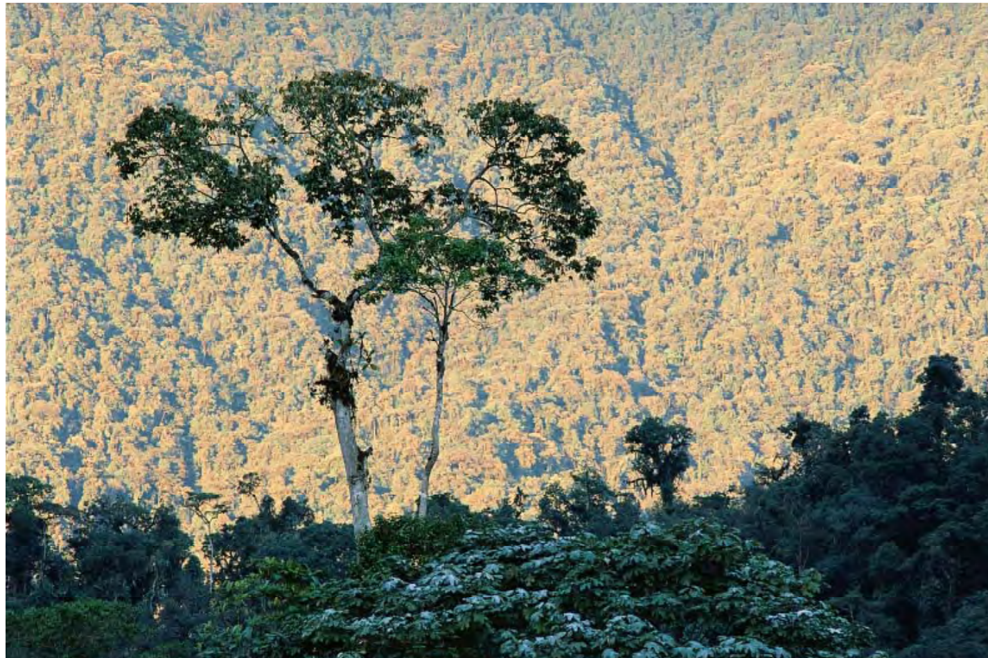
MURRAY COOPER (4)