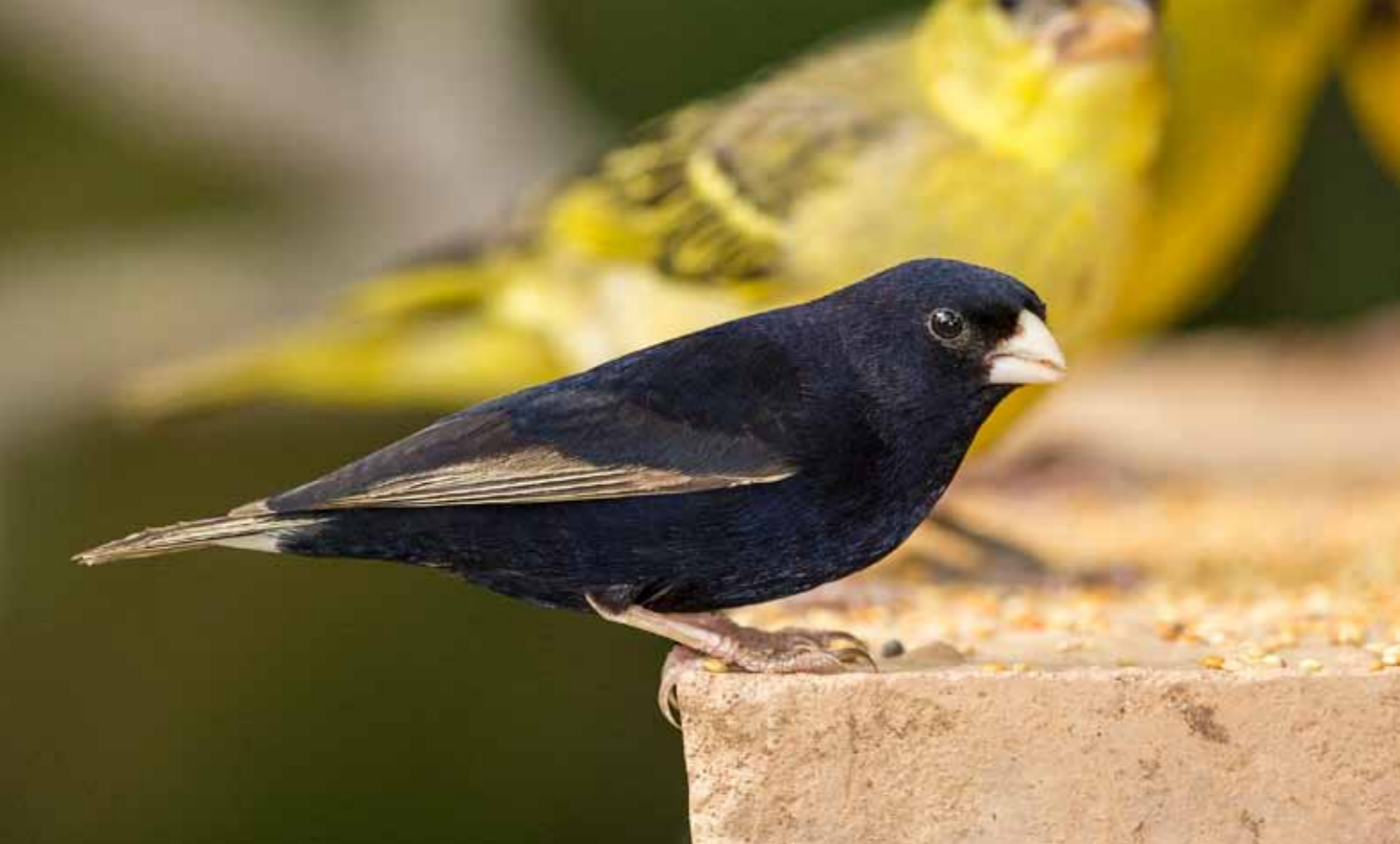
An adult male Purple Indigobird (above). This bird would have been raised in the nest of its specialist host, Jameson's Firefinch (opposite).

However, despite the apparent benefits of a parasitic lifestyle, less than one per cent of the world's bird species exclusively adopt it. Globally, obligate brood parasitism is thought to have evolved independently seven times in birds, with three separate origins among cuckoos and one each in the honeyguides, cowbirds and parasitic finches. Even a somewhat anomalous duck in South America has gone down this route. But why don't more bird species implement the strategy? One possibility is that while being a parasite avoids certain problems, it generates a whole set of new ones.