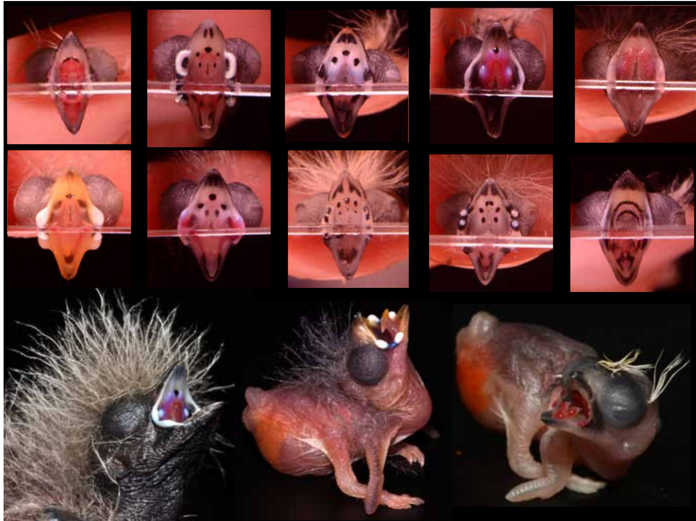
The nestlings of finches in the family Estrildidae are unusual in having very diverse and elaborate mouth markings. These images illustrate some of the diversity in nestling appearance that exists between species. The top two rows show the insides of the mouths of various species of nestling estrildid finch. The bottom row shows recently hatched chicks of three estrildid finch species. Many of these species are hosts to indigobirds and whydahs. Top row, left to right: Locust Finch, Common Waxbill, Blue Waxbill, Green-winged Pytilia, Orange-winged Pytilia. Middle row, left to right: Red-billed Firefinch, Jameson's Firefinch, Zebra Waxbill, African Quailfinch, Bronze Mannikin. Bottom row, left to right: Green-winged Pytilia, Red-billed Firefinch, Locust Finch.

To test for visual mimicry, we developed a method of photographing inside the mouths of Vidua nestlings. With the help of Jolyon Troscianko, we came up with a system in which the chick was held below a prism until its mouth opened naturally. We then gently pressed the mouth over the apex of the prism. This allowed the angular interior surfaces of the chick's mouth to be projected at a consistent angle onto the prism face opposite this edge, which could then be photographed with a specially modified camera that could detect ultraviolet light as well as human-visible wavelengths of light. The colours and patterns obtained from these images were then processed through models of avian vision, enabling us to assess the mimicry in a way that is relevant to the