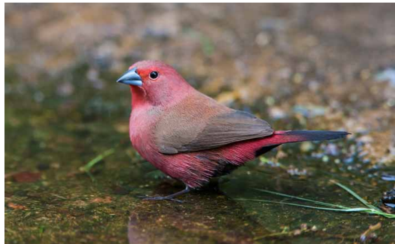
WARWICK TARBOTON (2)

The Estrildidae are exceptional in that, unlike the nestlings of most birds that are cryptically patterned, estrildid young boast the most elaborate and diverse appearances of any bird family in the world. Some have an almost otherworldly appearance, with luminous papillae lining the gape and complex combinations of spots and bars adorning the palate. These patterns vary widely between estrildid species but little within them, making them highly characteristic of each. It is not yet understood what evolutionary pressures led to the origin of nestling ornamentation in this