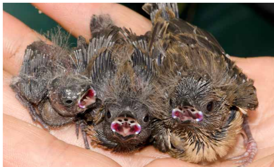
CLAIRE N. SPOTTISWOODE

however, due to the unique combination of appearance, calls and movements made by each species' young. A key barrier to host switching, and therefore speciation, seems to be persuading host parents to feed them adequate amounts of food rather than the right kind of food (DNA barcoding suggests little variation in nestling diet among estrildid finches in an area). Vidua overcome this by