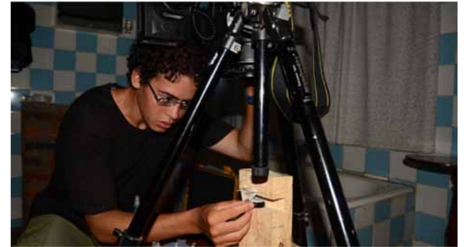
The author's set-up to photograph inside the mouths of nestling birds.

This imprinting mechanism has consequences for the formation of new Vidua