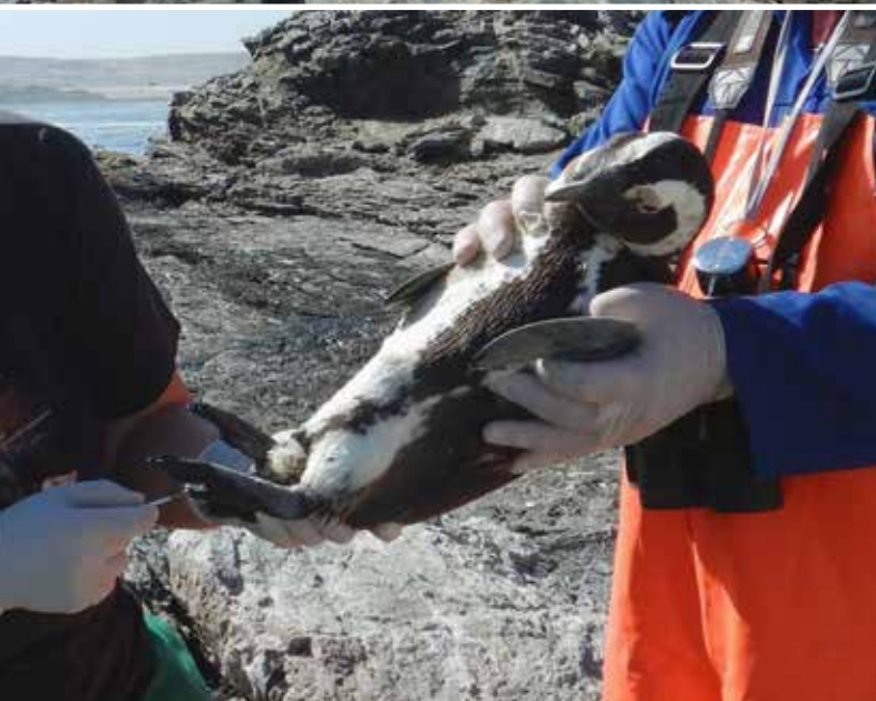
TOP, LEFT African Penguins that died from avian influenza on Halifax Island, Namibia, in 2019 were burned in pyres to destroy the virus.