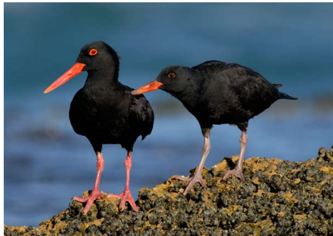
TOP AND ABOVE As chicks grow older, they need increasing amounts of food. When they are able to fly, and thus escape predators, they follow their parents around on the shore, incessantly begging for food. Once they are able to forage for themselves, however, they are evicted from the territory and for the next few years will have to put all their effort into survival to make sure they reach an age at which they too can breed.

Because oystercatchers rely entirely on food from the shore, storms can cause significant problems for these birds, denying them access to their food supply. This may be one of the key explanations for why they breed in summer