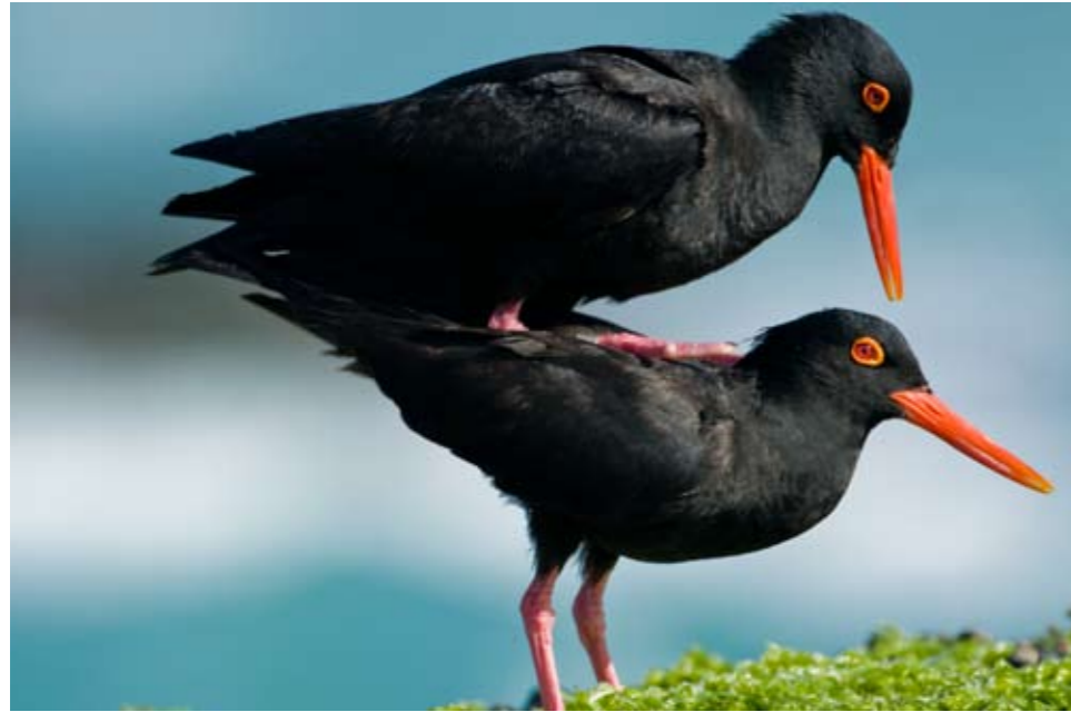
This mating pair neatly illustrates the differences in bill shape between the sexes. The bill of the male is short and chisel-ended whereas that of the female is longer and more pointed. These distinctions are reflected in subtle variations in their diets.