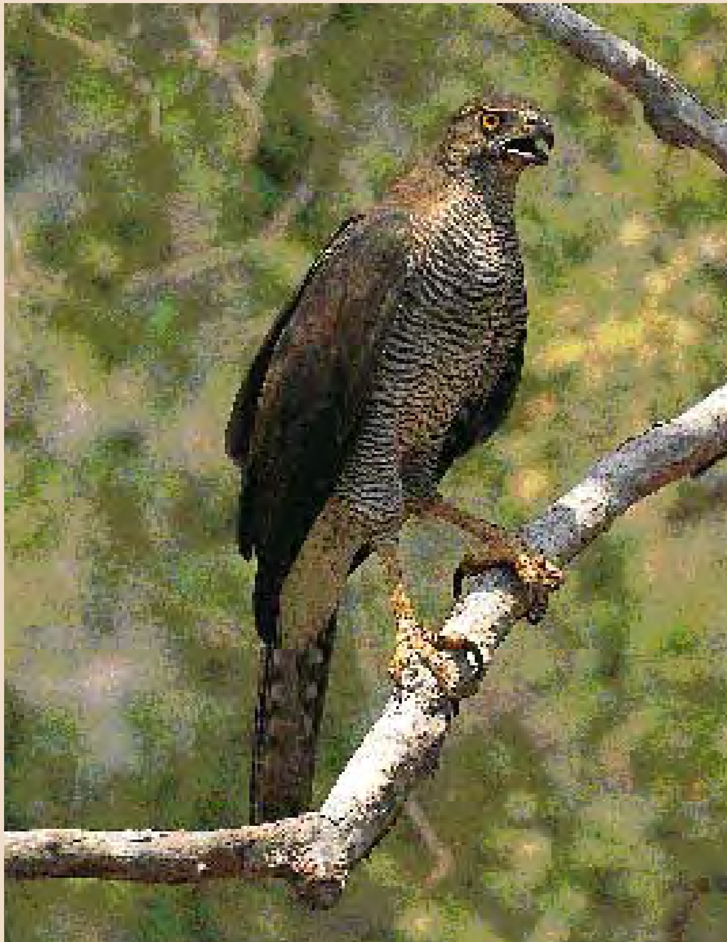
Henst's Goshawk Accipiter hentsii is a huge forest hawk. It is almost as large as, and is sometimes mistaken for, the much rarer Madagascar Serpent Eagle Eutriorchis astur.