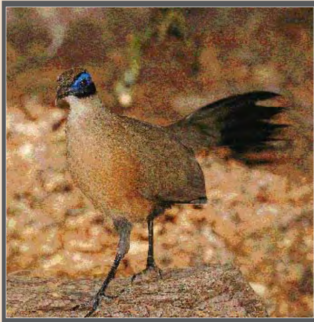
Above The leaf-litter below the deciduous and gallery forests of the west, and even in dry thorn scrub, is the hunting ground of the Giant Coua Coua gigas , the largest of Madagascar's 10 coua species. It forages for insects on the ground, but builds its nest up to 10 metres above ground in a tree.