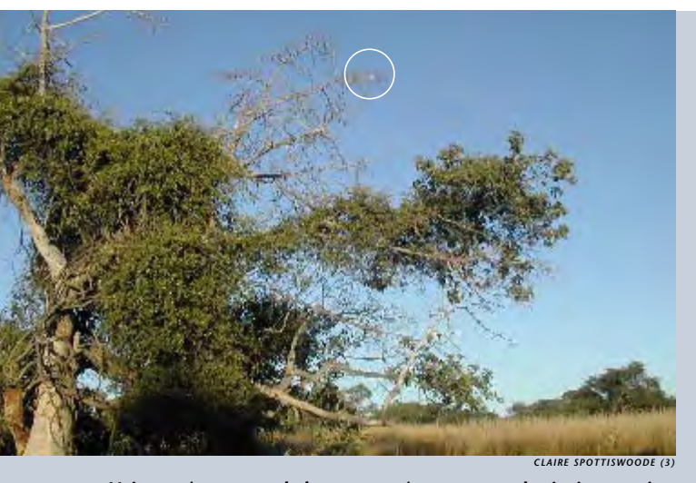
Using a 'scope and the camera's zoom results in impressive magnification, unheard of using even the largest telephoto lenses on an SLR camera. This Chaplin's Barbet (right) is barely visible in the fig tree (above, circled), but produced an image of sufficient quality to grace the cover of a recent book on Zambian birds.