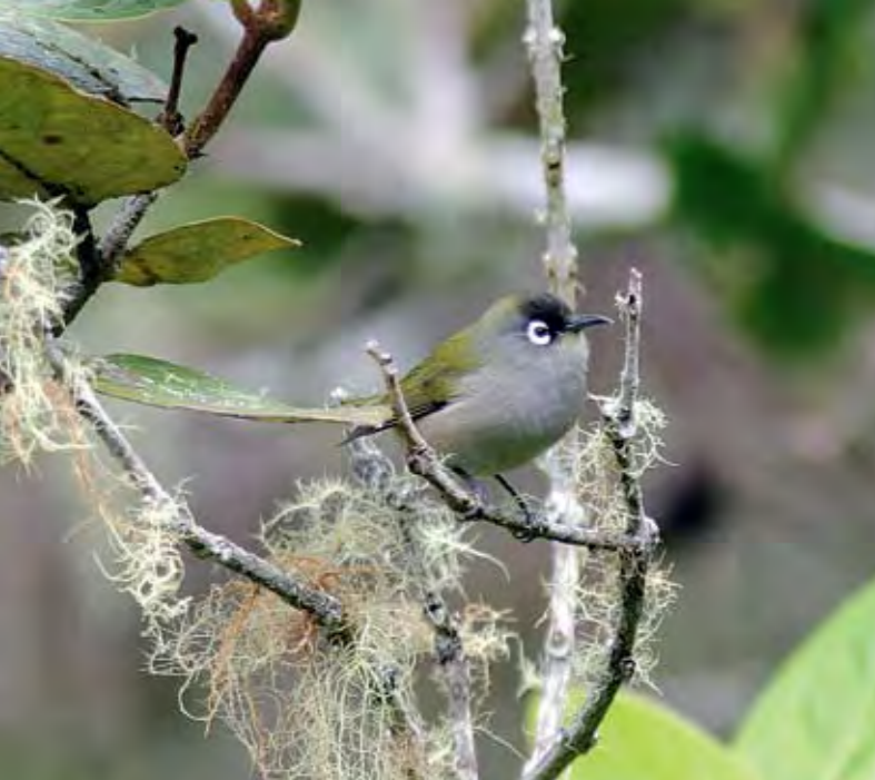
The Réunion Olive White-eye is confined to higher elevations, and has a distinctly long, decurved bill.

along the trail at La Roche Ecrite Reserve. Listen for the male's loud, repetitive whistle which gives it its local name: 'Tuit Tuit'. Like the harrier, it is listed as Endangered, and has a population of only some 120 pairs. It has suffered from habitat loss to forestry and alien plants, but nest predation by introduced rats is the most significant threat. Breeding success was low until poison bait was deployed around the nests to reduce rat numbers. Hopefully the combination of habitat restoration and rat control will ensure the long-term survival of this species.