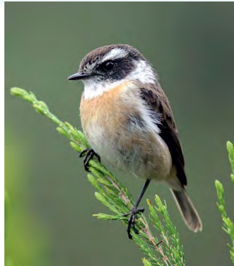
Above The Réunion Stonechat is one of the most abundant native birds, equally at home in alpine scrub and mid-elevation forest.

The Mascarene islands were uninhabited when they were discovered by Portuguese explorers sailing around the Cape to India in the early 16th century. However, they were almost certainly known to Arab seafarers, who plied the east coast of Africa and Madagascar as early as the 11th century. The Portuguese landed a few livestock, but the islands were only colonised more than a century later, with the French annexing Réunion in 1642. It was not as favourable as Mauritius as a way-station for passing ships, and was largely spared the attention of rival trading nations. Apart from a brief occupation by the English from 1810 to 1815, it has been a French colony throughout. ▸