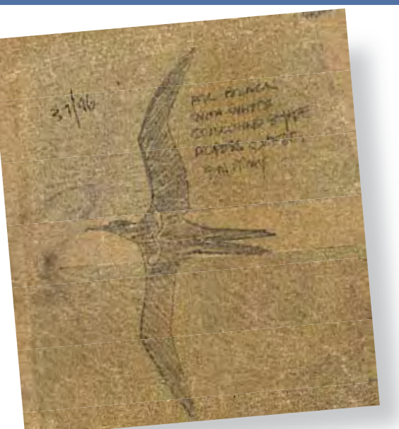
A picture can tell a thousand words! Field sketch of the Durban Lesser Frigatebird made at the time on a brown paper bag from Len Jones' tackle box.

190 nautical miles south of Cape Town on 25 January 1995 (A. Marchant, B. Dyer). Despite the fact that this species is now known to breed on at least one island off the Western Cape coast (AB&B 1(3):13), very few sightings are reported, even though the bird is probably regular seaward of the continental shelf in summer.