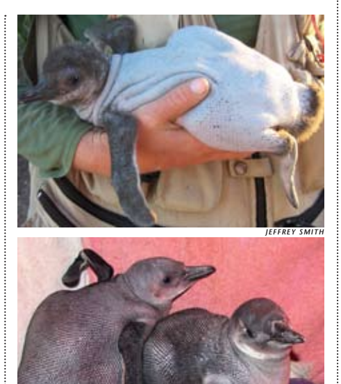
Magellanic (top) and African (above) Penguin chicks affected

'Feather-loss disorders are uncommon in most bird species. We need to conduct further studies to determine the cause and see if this is in fact spreading to other penguin species,' said Dee Boersma, who has conducted studies on Magellanic Penguins for more than three decades. 'We need to learn how to stop its spread, as penguins already have problems with oil