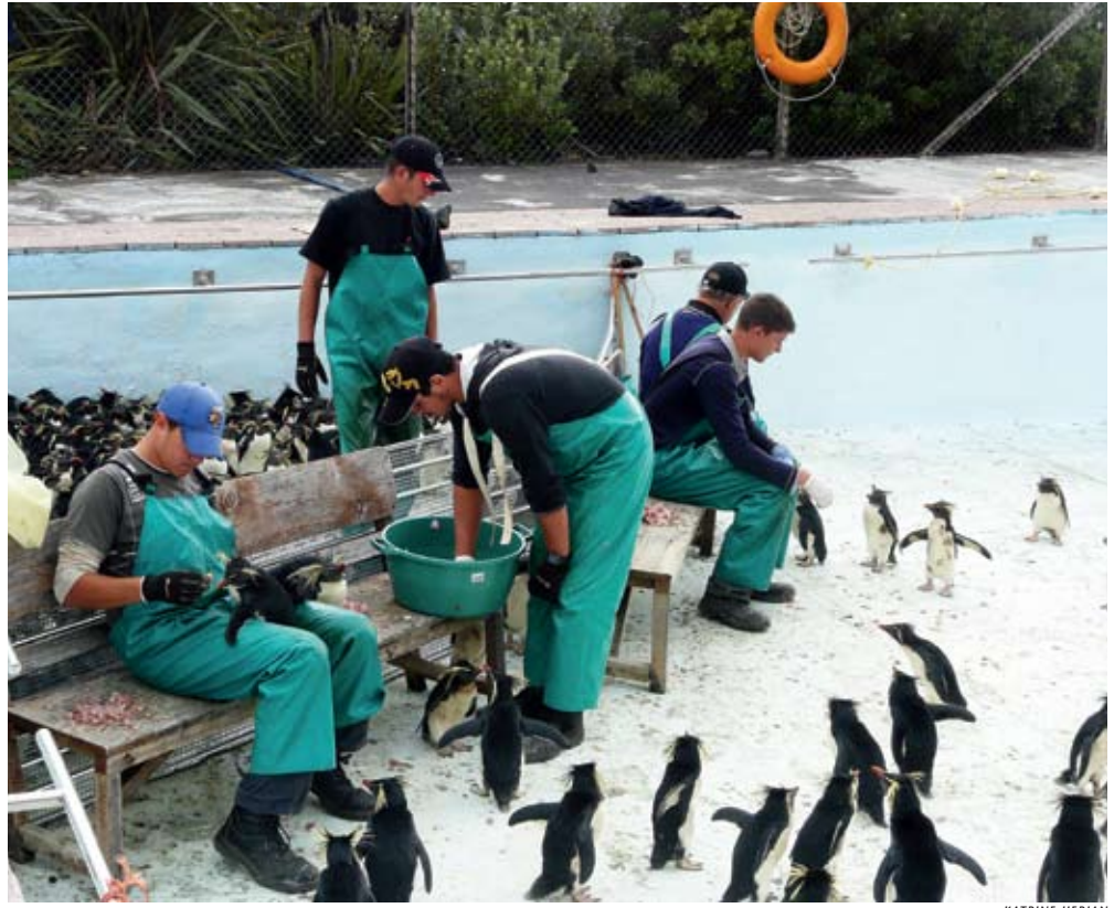
Tristan Islanders feed oiled Northern Rockhopper Penguins in the island's swimming pool, which was partly drained as an exercise pool.

islands, which has severe implications for the Tristan economy. The one positive outcome is that there are moves afoot to declare the Tristan Islands a Particularly Sensitive Sea Area, which would require passing ships to remain further offshore. hopefully preventing a mishap like this from happening again. PETER RYAN