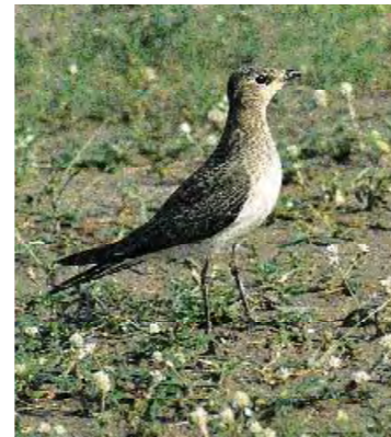
The grasslands alongside the Nile are a favourite haunt of the Red-winged Pratincole.

The Nile is also home to birds of more general distribution; exposed rocks near the magnificent Murchison Falls attract enormous numbers of Rock Pratincoles, which can congregate in flocks exceeding a thousand birds. Three species of pratincole are river specialists; Rock and Grey in Africa and Small Pratincole in India, Burma and Thailand. These gregarious birds co-operate in the defence of nests and young against predation and also indulge in fantastic displays of injury-feigning in which the striking black and white rump and tail patterns are flashed at the intruder. Other complex behaviour patterns during breeding involve display flights with wings held high above the back and greeting displays during which the collar is flared out, sometimes for as long as 20 seconds, to show the maximum amount of chestnut. Rock Pratincoles restrict periods of co-operative aerial hawking of insects to early morning and dusk, spending most of the hot part of the day roosting and