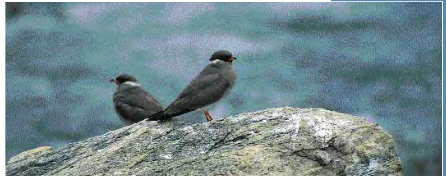
The river-associated Rock Pratincole breeds above Murchison Falls.

preening on open rocks. These birds have been recorded hawking around street lights at night.