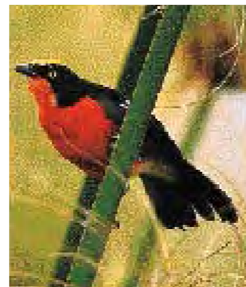
The startling coloration of the Papyrus Gonolek is seemingly at odds with its furtive and stealthy behaviour.