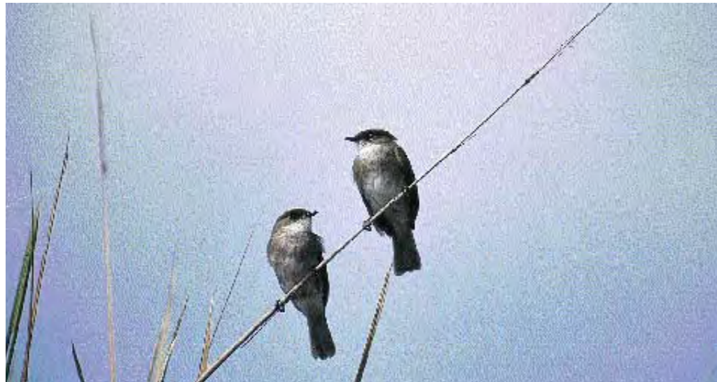
The Swamp Flycatcher patrols the waterways, flitting out to catch insects before returning to its reed perch.

The papyrus holds birds not only aberrant in shape and form, but specials that are inexplicably rare, such as the enigmatic Papyrus Canary and Papyrus Yellow Warbler. In fact, no one has yet even been able to provide convincing evidence of the latter species' call. Perhaps the most remarkable thing about the yellow warbler is its absence in extensive and apparently perfectly suitable swathes of habitat. Throughout its strange global distribution it is always patchy and highly fragmented; while it favours dense monospecific papyrus swamps, it occasionally occurs in other types of swamps, but only in the wettest and highest places, where it appears to be more abundant. One suggestion to explain its rarity is that it competes with the African Reed Warbler and it seems to be more abundant where the latter species is absent. Seldom observed, this bird spends much of its time hopping about low down between papyrus stems, searching for tiny insects. Morphological adaptations to its life in the papyrus include having huge, strong toes and claws and a hind claw four to five times the standard length of a yellow warbler hind claw. Both the warbler and the canary have close relatives in habitat adjacent to the swamp systems they inhabit, suggesting that their evolution has been recent.