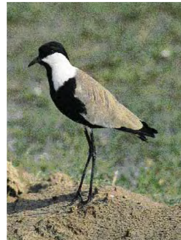
Spur-winged Plover, riverside resident on the Nile.