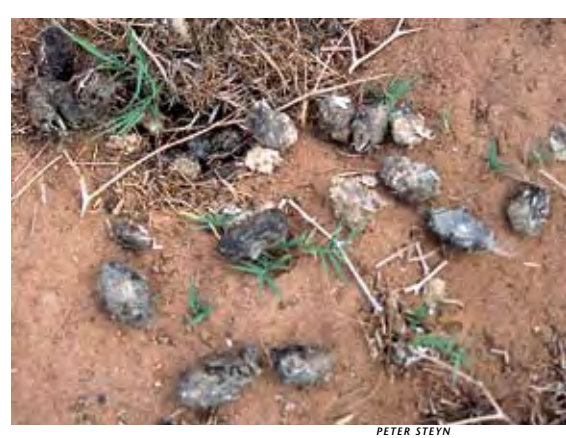
Above Pellets regurgitated by raptors and some other birds consist of indigestible materials, most notably bone and fur.

Diurnal raptors ... form pellets consisting of hair, bone and other similarly indigestible material, with the pellets cast in the gizzard and then regurgitated. In this way these problematic materials are kept out of the birds' intestines