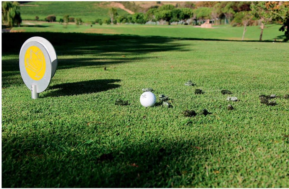
RICHARD GIE (2)

above 'Hotspots' are where the geese aggregate daily and therefore where their droppings need to be removed most frequently.