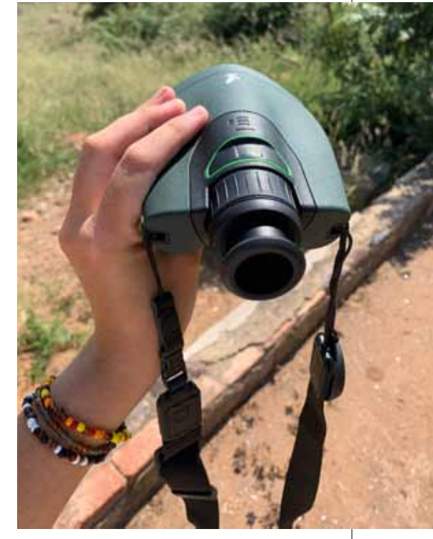
Ergonomically, the dG is is comfortable to hold and remarkably light in weight.

This advance was taken a step further when Swarovski teamed up with the Cornell Lab of Ornithology in a partnership that enables photos taken by >